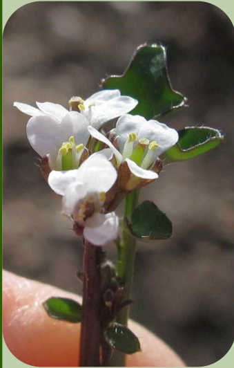
Cardamine hirsute , Hairy Bittercress Exeter River Trail Gibraltar, PA 3/10/21