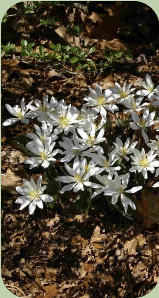
Bloodroot Sanguinaria canadensis