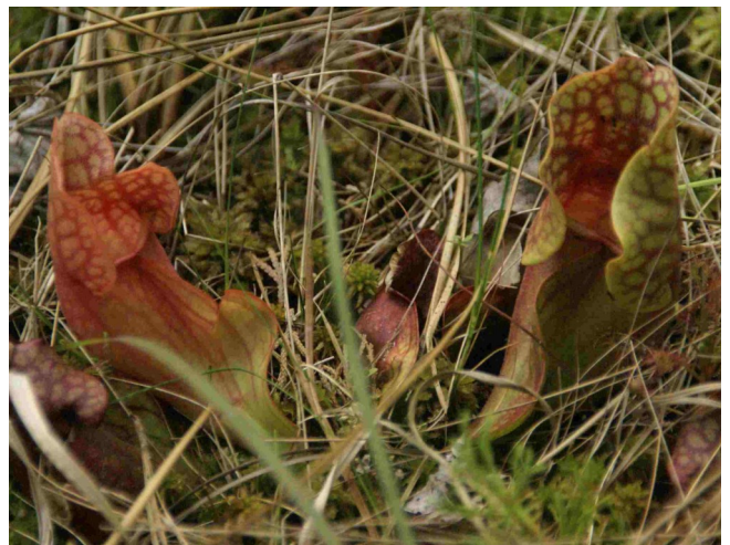
Pitcher Plant , Brendan Byrne State Forest, 2008 with Otto Heck

We will start at Pakim Pond in the Brendan T. Byrne State Forest where we are likely to see Curley Grass Fern, Pitcher Plants and other carnivorous plants, and a good selection of wetland plants. We will then go to Webb's Mills where we should see Box Asphodel, Gold Crest and more wetland plants. The next stop will be Warren Grove to see the pine plains. If time permits we can go to the FAA radio tower to see some upland plants. Detailed directions in July Newsletter.