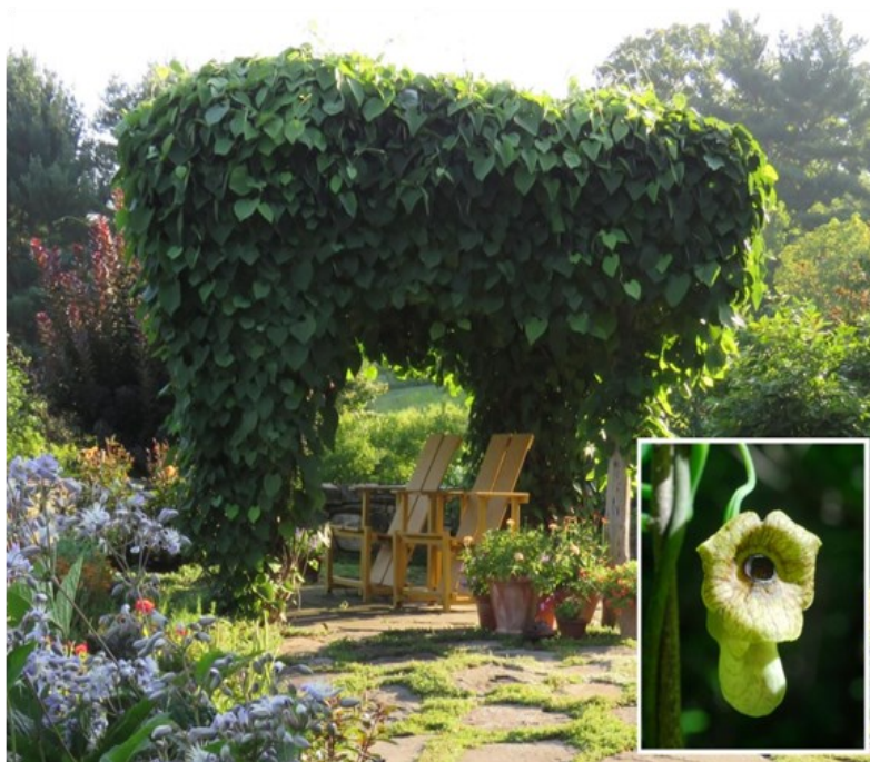
Aristolochia macrophylla (Dutchman's Pipe)

Native plants are important because they adapt to local environmental conditions, they require far less water, saving time, money, and perhaps the most valuable natural resource, water. In addition to providing vital habitat for birds, many other species of wildlife benefits as well.