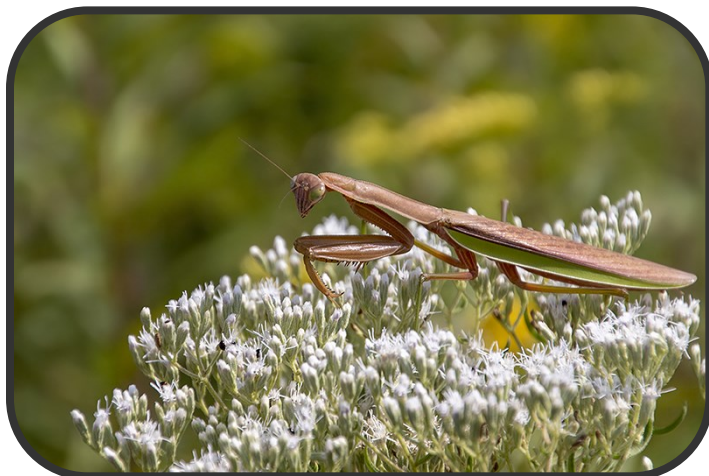
Eupatorium hyssopifolium (Hyssop-leaved thoroughwort)

Bonesets, many golden composites - nine species of Goldenrod, several kinds of Sunflowers and Cone-flowers, Black-eyed Susan, and numerous other yellow-flowered species such as Wild Senna, and Partridge pea.