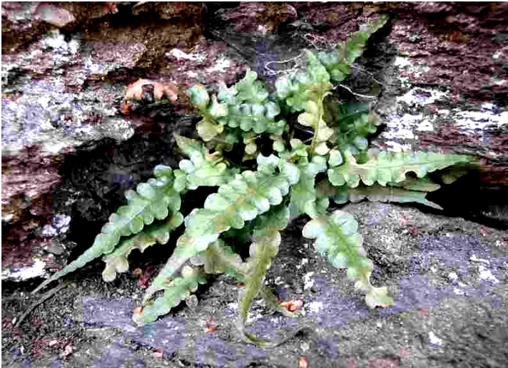
Asplenium pinnatifidum (Lobed spleenwort)

On an overcast and hot muggy morning the DVFWS met at Tucquan Glen Nature Preserve in Lancaster County to challenge not only the heat, but also bugs, briars, and a wet trail. As always, just in view of the parking lot we observed our first gem. Asplenium pinnatifidum (Lobed spleenwort) was basking in a rock ledge.