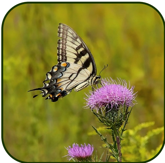
Cirsium discolor (Field thistle)

We entered the expansive meadow through its surrounding woodland border where we spotted some shade-loving blooms – Great blue lobelia, Cardinal flower, White wood Aster, White turtlehead, and fronds of Royal Fern, one of the few ferns seen on this excursion. Then we walked into sunlight on spacious mown pathways, bordered by lush late-season growth. Among the many wildflowers we encountered were: dusty-pink Joe Pye weed, magenta New York Ironweed, numerous species of the white rayless composites – Pilewort, Horseweed, and