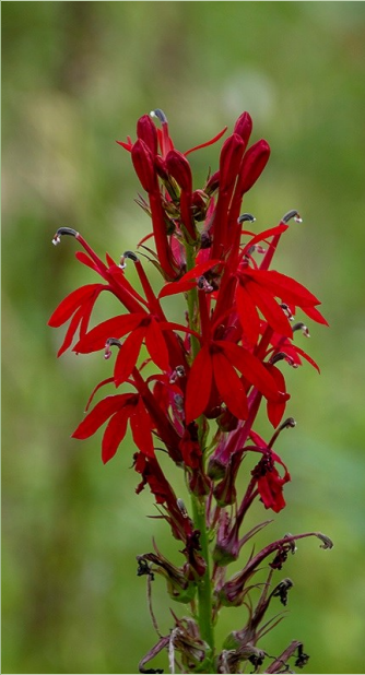
Cardinal Flower Lobelia cardinalis