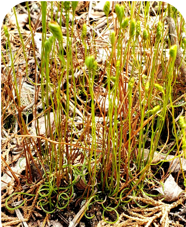
Schizaea pusilla , Curly grass fern

The smallest plant of interest was the curlygrass fern ( Schizaea pusilla ). Looking closely also gave us a view of the threadleaf and round leaf sundews.