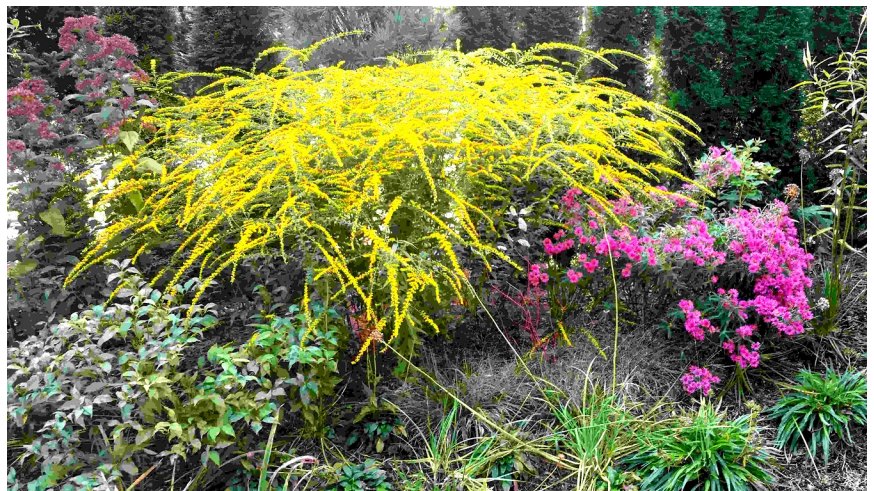
Solidago rugosa (Fireworks goldenrod) and aster Symphyotrichum novae-angliae 'Andenken an Alma Pötschke'

A long pergola fronted by a wide planting bed, is where volunteers recently planted a hundred different plant species. These new plantings take advantage of the shady and sunny ends of the bed and include salvia, hibiscus, prickly pear cactus, and several fern varieties. At the far end of the pergola, a native hops plant ( Humulus lupulus ) grows up and over the pillars beginning what will eventually be a cool shady retreat. Leading from the pergola is a long dense hedge of a compact variety of southern magnolia. Towards the back of the property a sapling of mountain silverbell that was donated by a DVFSW member is doing well. A huge American elm that stood nearby unfortunately died this year and has been removed.